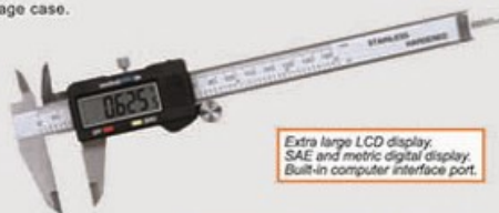
Extra large LCD display. SAE and metric digital display. Built-in computer interface port.