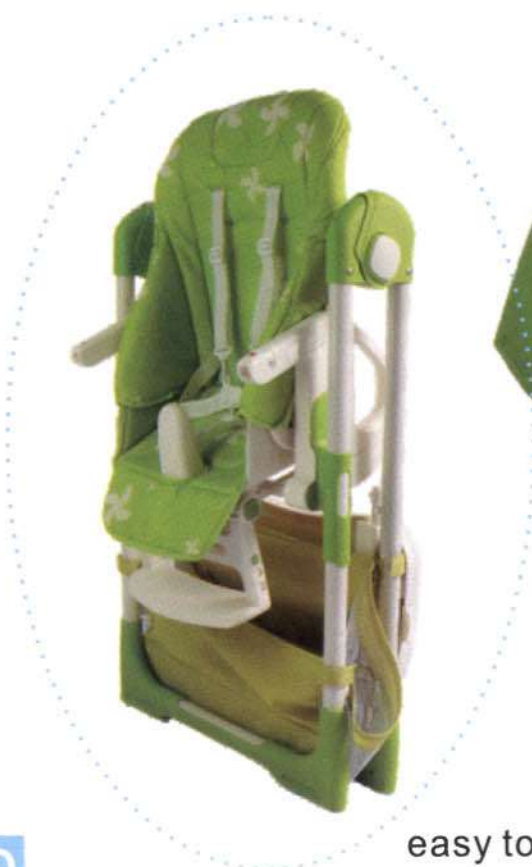
easy to storage