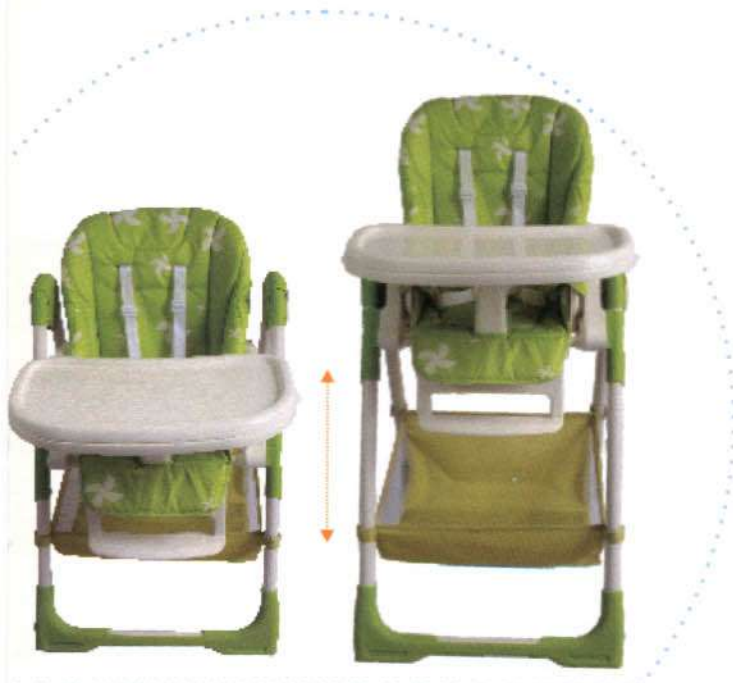
6 positions adjustable for height

(Footplate, seat and backrest can be adjust position spearately)