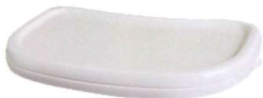
Movable double tray