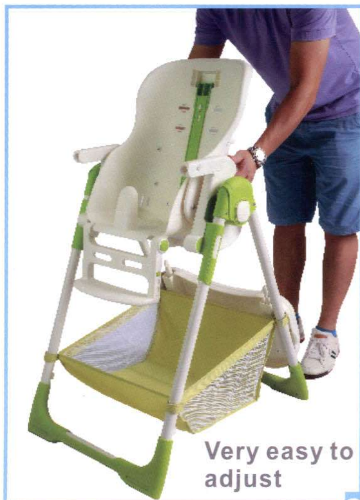
Very easy to adjust